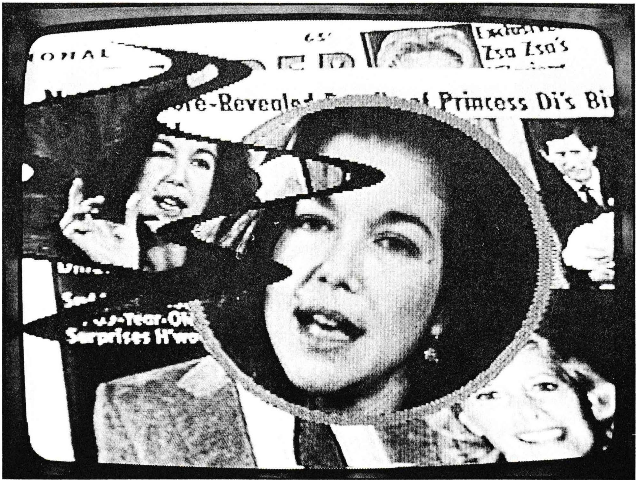
NATALIE DIDN'T DROWN, color videotape, 1983