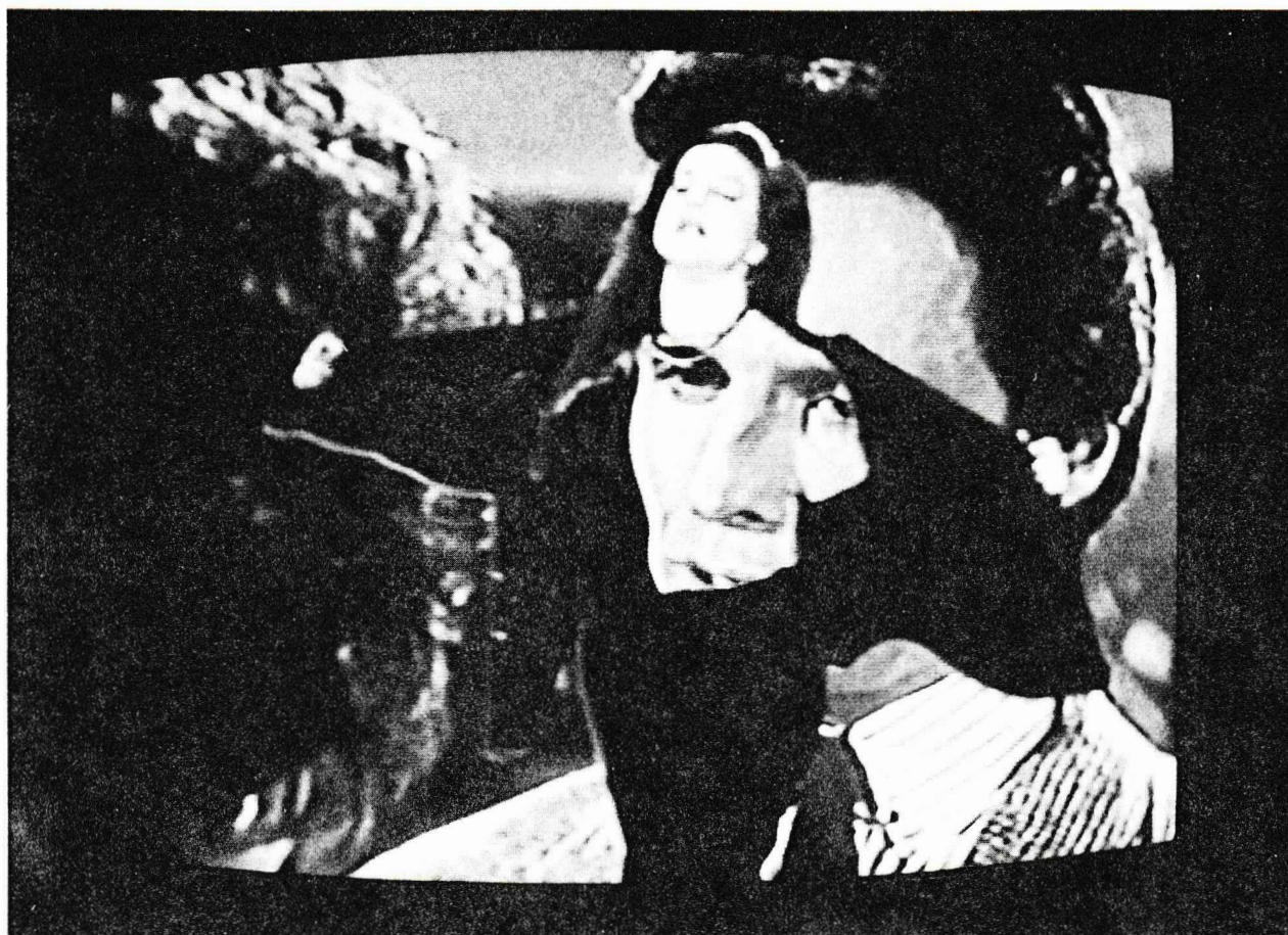
JOAN DOES DYNASTY, color videotape, 31 minutes, 1986